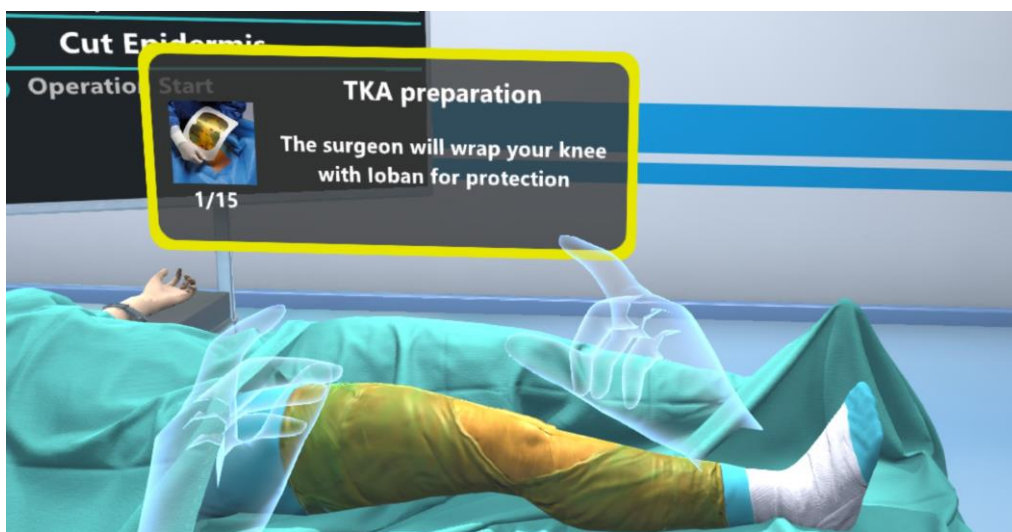
Figure 2. Visualizing important information on the upcoming surgery

Educational and Information Module: This module provides to the users all necessary information about their upcoming operation. Graphics and animation facilitate the comprehension of medical terms and procedures. Pre and post-operation care instructions are included for the patient and their care team (informal carers). The VR software provides visualization of the hospital environment from the operating rooms to the surgical ward and postoperative recovery room based on local plans. Through the use of VR, the patients can navigate through the hospital and familiarize themselves with the environment including hospital facilities and plans. The educational module is tailored to patient needs to enhance information and learning during the hospitalization period with gamification elements and advanced interactive features from within an immersive virtual environment. The proposed VR component transforms patient empowerment to a cost-effective, easily and broadly accessible process. A fully customizable software development kit (SDK) is used to generate educational VR content with minimal adaptations (figure 2). The latter is accomplished by prototyping the learning pipeline into structured, independent and reusable segments, which are used to generate more complex behaviours.